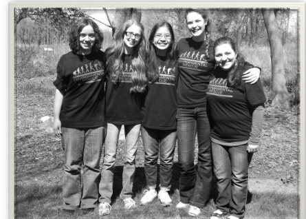
DuPage County Top scoring team, Wheaton North

Cook County: Glenbrook South High School, Glenbrook