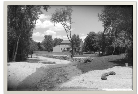
Lawndale Park Creek with native seed and blanket