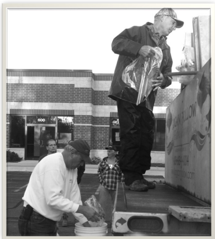
Fall Fish Sale